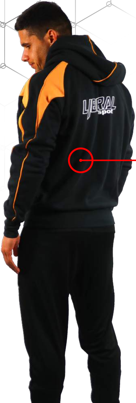
WINTER HOODIE CODE: MW02

A heavyweight cotton hoodie, suitable for colder conditions because of its thickness. With an embroidered logo and vinyl back print.