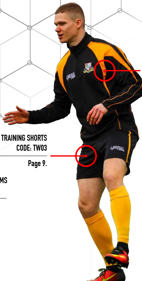
QUARTER ZIP CODE: TW04