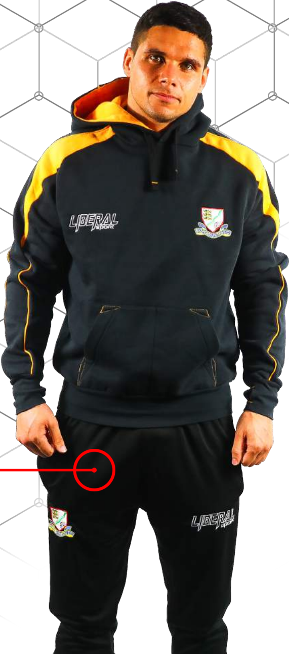
TRAINING BOTTOMS CODE: TW02