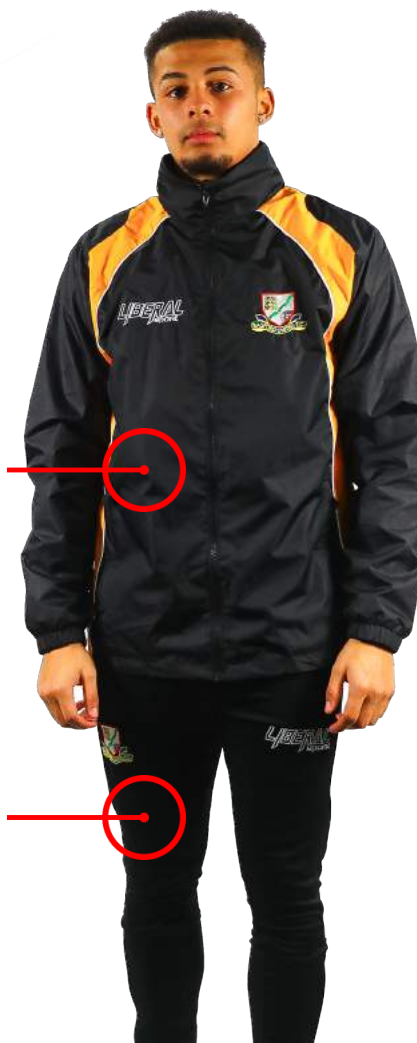
WINDBREAKER CODE: MW04