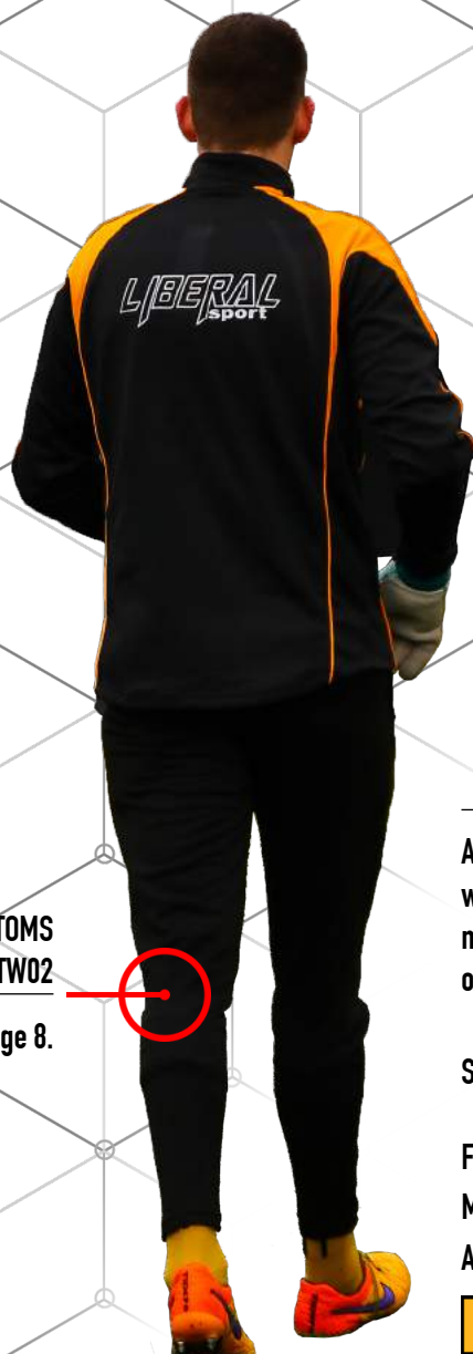
TRAINING BOTTOMS CODE: TW02