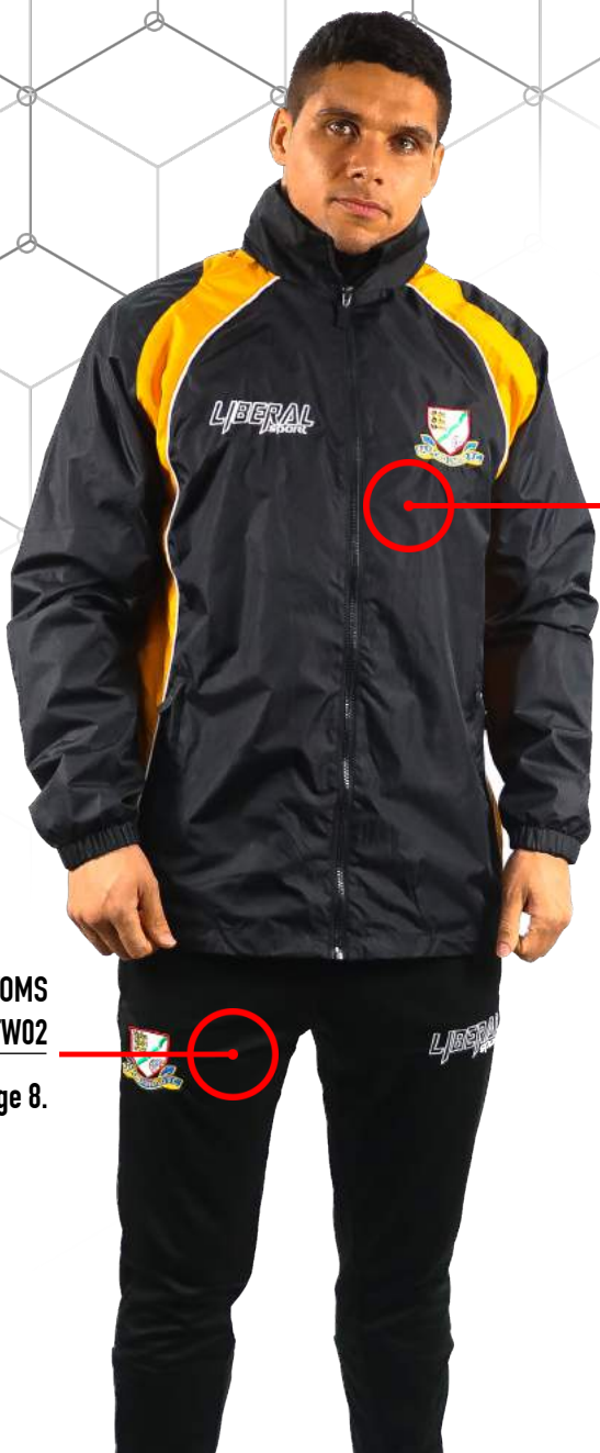
WINDBREAKER CODE: MW04

A waterproof windbreaker with an inside mesh lining, suitable for wet conditions and training in cold weather. With an embroidered logo and vinyl back print.