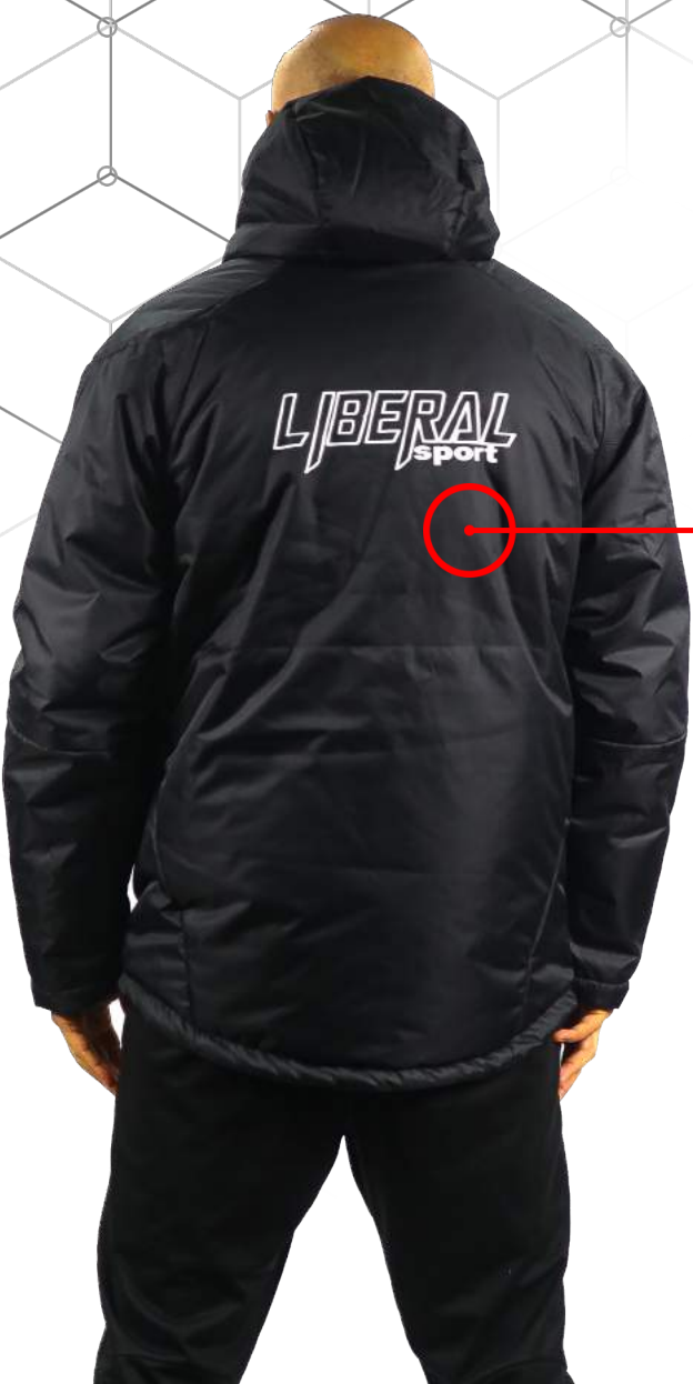
WINTER COAT CODE: MW03

A padded waterproof coat, suitable for colder conditions because of its thickness, especially for managers to wear. With an embroidered logo and vinyl back print.