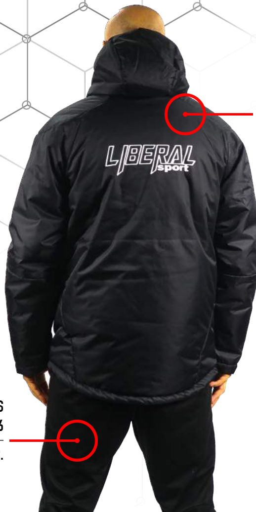
WINTER COAT CODE: MW03