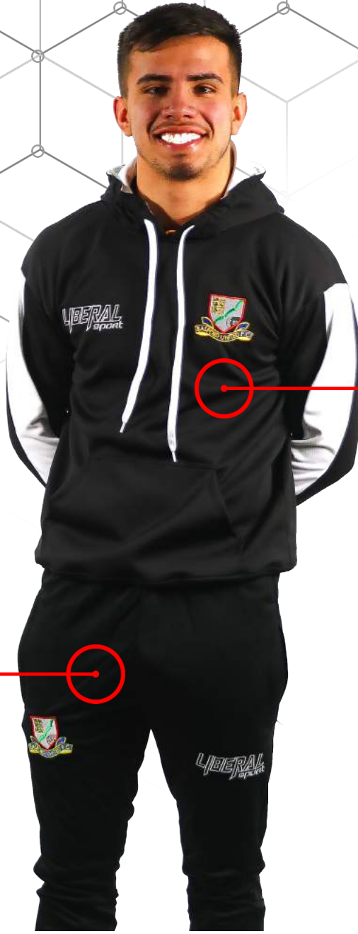
TRAINING HOODIE CODE: TW04

A lightweight hoodie suited to the conditions of training. With an embroidered logo and vinyl back print. Also suited for matchday wear