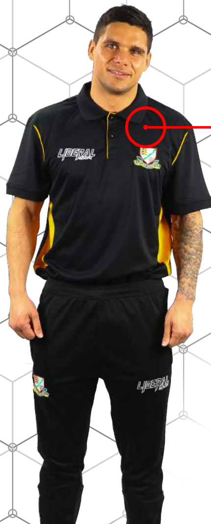
POLO SHIRT CODE: MW01