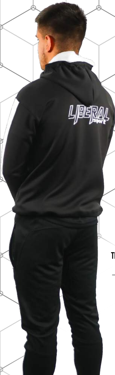
TRAINING BOTTOMS CODE: TW02