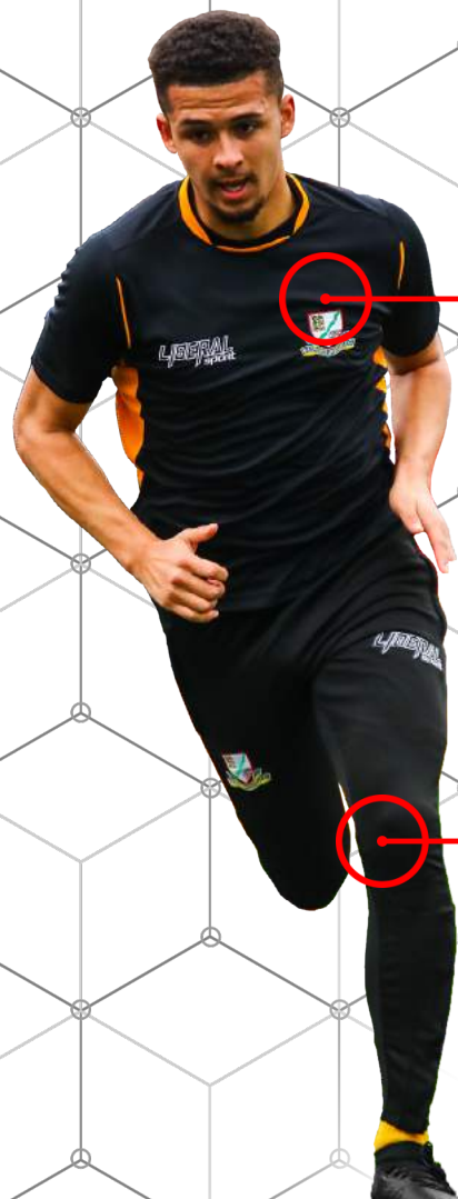
TRAINING T-SHIRT CODE: TW01