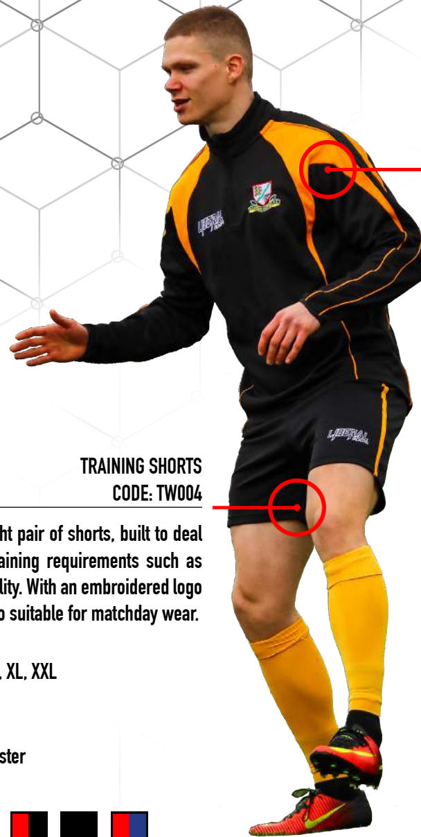
TRAINING SHORTS CODE: TW004

A soft and lightweight pair of shorts, built to deal with the specific training requirements such as moisture and durability. With an embroidered logo on the left thigh. Also suitable for matchday wear.