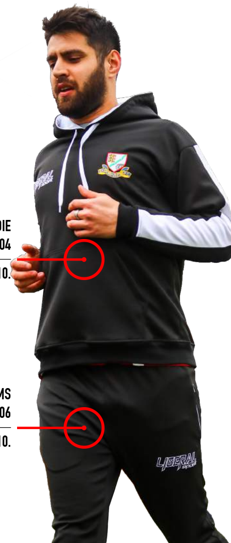
TRAINING HOODIE CODE: TW04